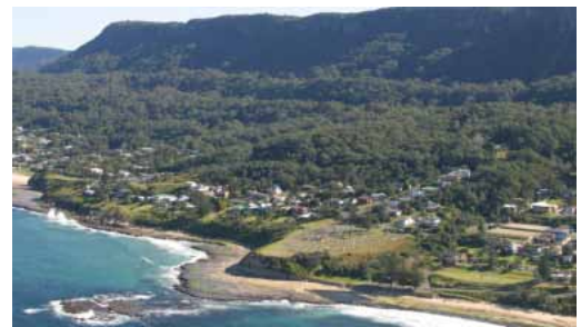
Illawarra coast, NSW.

Enable the transferability of research findings beyond the Cluster to maximise impact and relevance of the Cluster for future science-governance interaction.