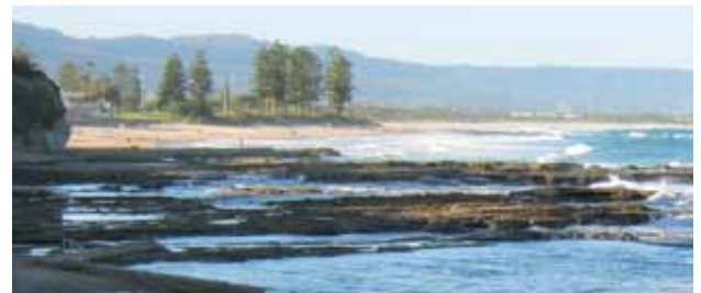
North Wollongong Beach, NSW.