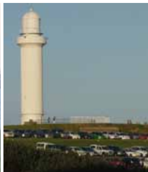
Wollongong Lighthouse, NSW.