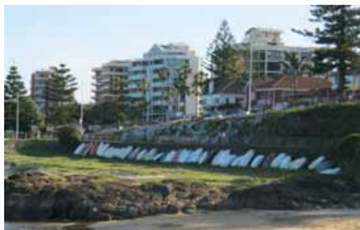
Belmore Basin, NSW.

Enable the transferability of research findings beyond the Cluster to maximise impact and relevance of the Cluster for future science-governance interaction.