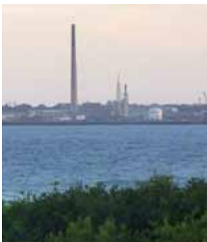
Steelworks, Port Kembla, NSW.